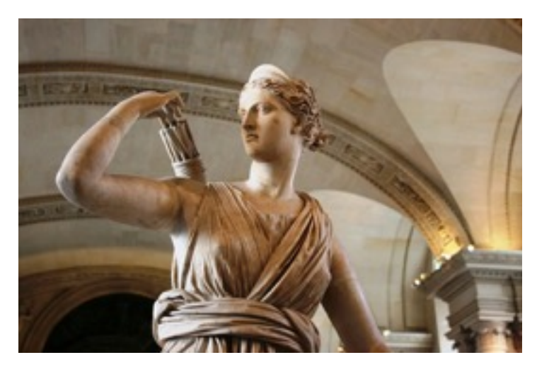
Artemis, the huntress, carries away Iphigenia into her temple, so that she can be spared the family drama and study the healing arts.

Iphigenia, alone in the temple of Artemis, has been spared the family drama. Instead, she has been focusing on studying the spiritual arts. When her brother is driven to her temple by his suffering, she is able to heal him and take away his madness.