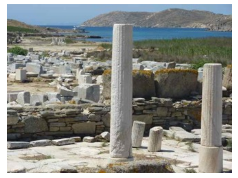
The Island of Delos, sacred birthplace of Moon Goddess Artemis and Sun God Apollo.

Living a spiritual life is an act of Service.