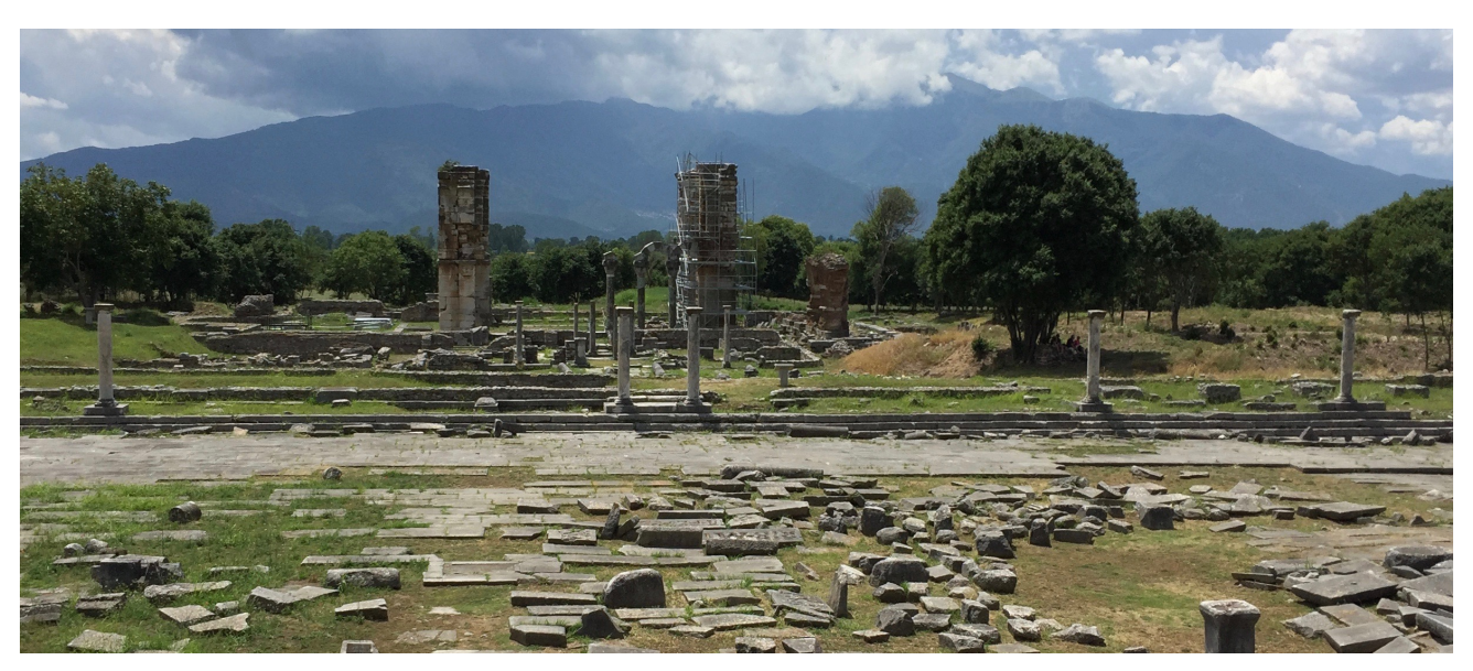
Ancient city of Philippi, Greece

For more information on the conference, follow the link: http://channellinglove.com/celebration-of-life-and-love/