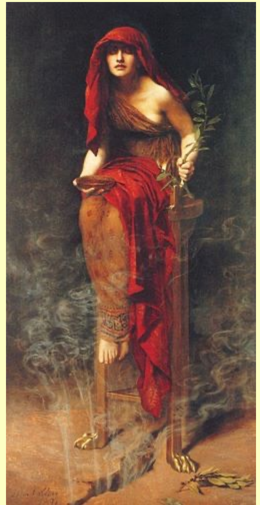
Pythia - the Oracle of Delphi

There are speculations that the oracle centre would use its position to promote a political stance, sometimes to its detriment. Having Apollo say what should be done, which leader should be elected, and which city should be chosen for certain things, could be very convenient. One of the most famous