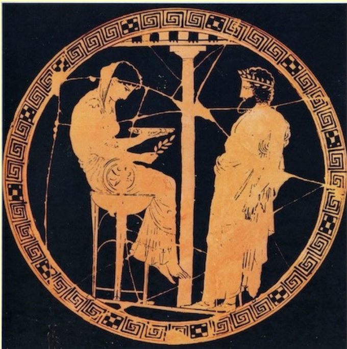
King Aigeas of Athens consulting Pythia

political oracles is the one given to the Greek Macedonian King, Alexander the Great. He went to Pythia, and was admitted to the inner sanctum, on the excuse that he was the son of Zeus. He asked whether he, with the help of the rest of the Greek states, should undertake a campaign to conquer Persia, Greece's old enemy. Pythia said that he should not, and unlike her usual unclean self, she was quite adamant. Alexander became angry and took away her tripod, the three-legged stool she sat upon, and broke it in pieces. He said Apollo be damned, and he followed his own mind.