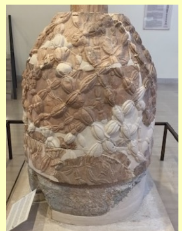
Omphalos Stone - the navel of the world, Delphi Museum