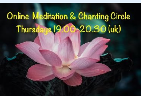
Online Meditation & Chanting Circle Thursdays 19.00-20.30 (uk)

The cost of the circle is £7.50, and you can pay by bank transfer, or PayPal using email address – info@isis-school.com . (PayPal fee is £8.00 for overseas participants. For programme details click here )