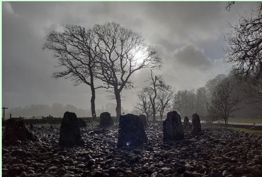
Standing stones, Kilmartin, Scotland.

People may have visited a traditional medicine man or woman to have a disease extracted, or an issue resolved. The medicine person would use a variety of methods including herbs, prayers, and petitioning saints. If nothing was happening at the physical level, s/he might use divination and relay the advice of the spirit helpers.