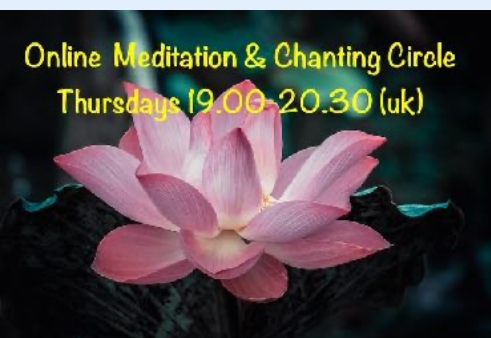
Online Meditation & Chanting Circle Thursdays 19.00-20.30 (uk)

The cost of the circle is £7.50, and you can pay by bank transfer, or PayPal using email address – info@isis-school.com . (PayPal fee is £8.00 for overseas participants. For programme details click here )